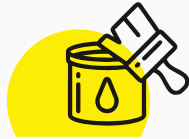
Paints, Wall Putty & Gypsum Board