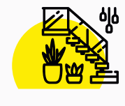
Interior Décor & Exterior Cladding Solutions