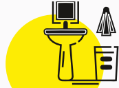
Hardware, Bathroom Fittings & Sinks