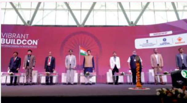
Dignitaries on Stage