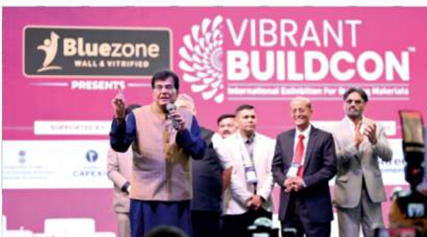
Shri Piyush Goyal Addressing Vibrant Buildcon's Success