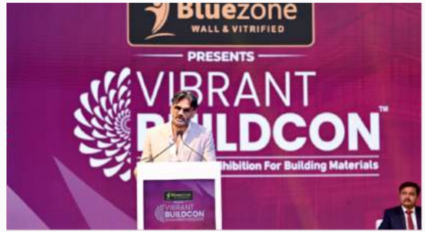
Mr. Suniel Shetty (Actor & Brand Ambassador of Vibrant Buildcon 2025)