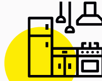
Electronics & HVAC