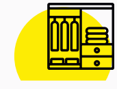
Modular Furniture, Office & Home Interior Solutions