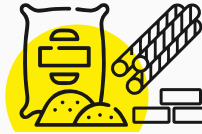
Cement, Steel & Lightweight Construction Blocks (AAC)