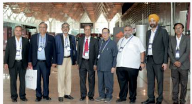
Vibrant Buildcon with Capexil

(Hon'ble Former Minister of State for Agriculture and Farmers Welfare of India)