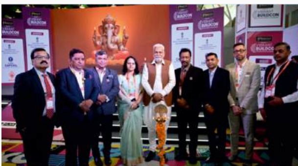
Shri Parshottam Rupala

( Commerce Secretary, Ministry of Commerce, Government of India)