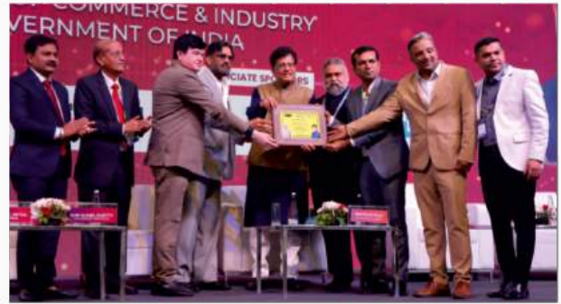
Honoring Shri Piyush Goyal With Memento