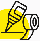
Glue, Tile Adhesives, Grouts & Construction Chemicals