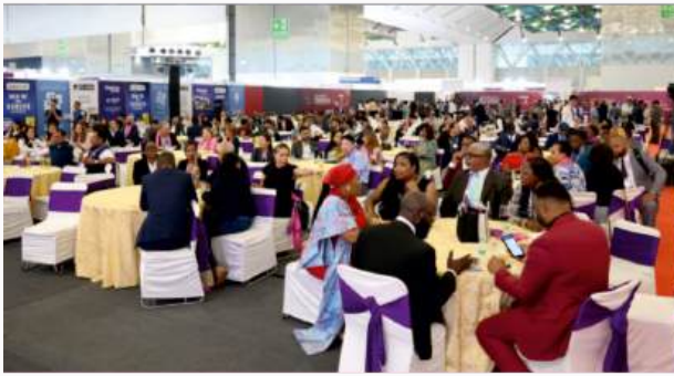
A Joyful Gathering Over A Grand Gala Dinner