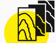
Timber, Plywood, Laminates, Surfaces & Flooring