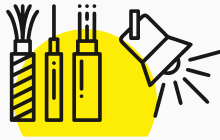
Electrical & Lighting Solutions