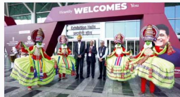
Welcome In Traditional Way