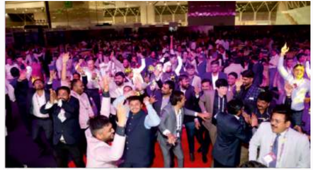
Gala Vibes And Good Times.