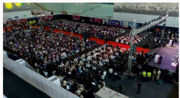
The Participants During Inauguration Ceremony