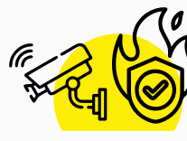
Fire Safety Systems, Surveillance & Access Control Solutions