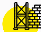
Scaffolding & Formwork