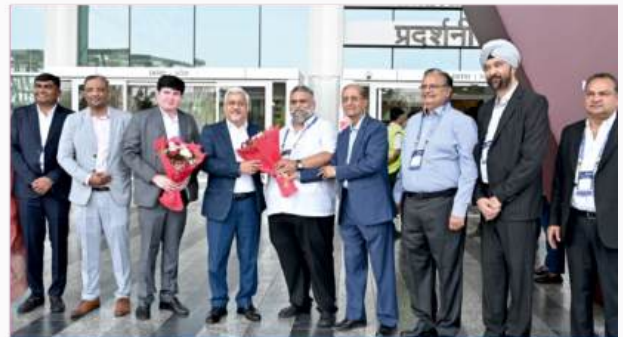
Shri Sunil Barthwal

(Hon'ble Minister of Youth Affairs and Sports and the Minister of Labour and Employment)