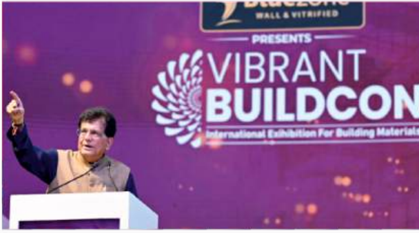
Shri Piyush Goyal (Minister of Commerce and Industry, Government of India)