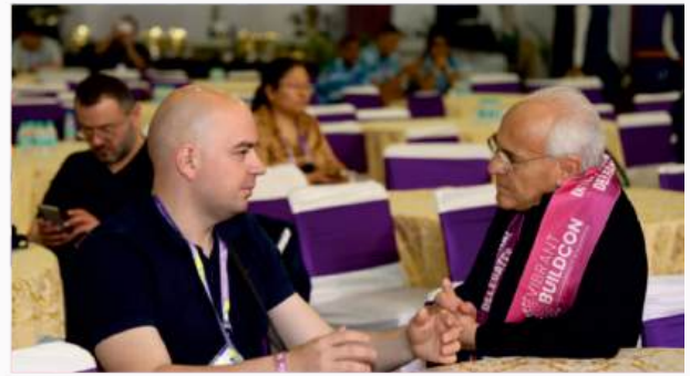
Networking at Gala Dinner