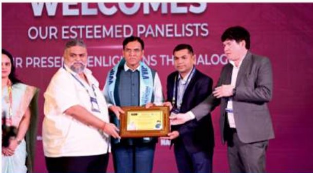
Shri Mansukh Mandaviya

(Hon'ble Minister of Youth Affairs and Sports and the Minister of Labour and Employment)