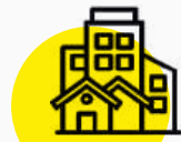
Real Estate & Infrastructure Developers