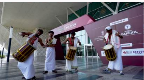
Welcome In Traditional Way